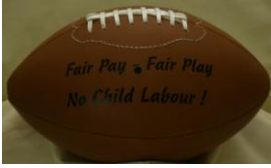
North American football.

Football for practice: With a smooth PVC cover, 4 linings of polyester and cotton and a latex balanced bladder.