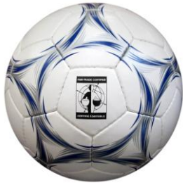
Match Plus ball.

Match Plus: with improved, longer lasting cover of Korean Duxon Shine. Sizes 4 and 5 with our new design in blue. Available in red for large orders (minimum 20 balls) Great for adult practice and teen games and guaranteed for 1 year.