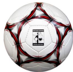
League Plus ball.

SCHOOL QUALITY. Now with butyl bladder and a 1 year guarantee. These are replacing the PVC covered balls since they have a longer lasting polyurethane material (PU) that does not contain Chlorine, an element harmful to the environment