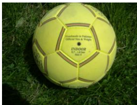
Indoor soccer ball.

Indoor: Sizes 3,4 & 5 with outer material of Japanese Cordley Felt Yellow and polyester linings, latex balance bladder and butyl valve. Weight is 410-430g. Cotton filled for low bounce and ideal for gym use, with hard surfaces.